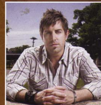
Jeremy Camp Special Musical Guest

This landmark event will show you what your relationship looks like through God's eyes. Focus on Marriage will help you understand the higher purpose of your marriage, while providing practical insights to help with everyday issues.